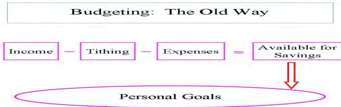
Chart 2. Budgeting: The Old Way

L. Tom Perry suggested something similar to this new pattern for budgeting when he wrote: